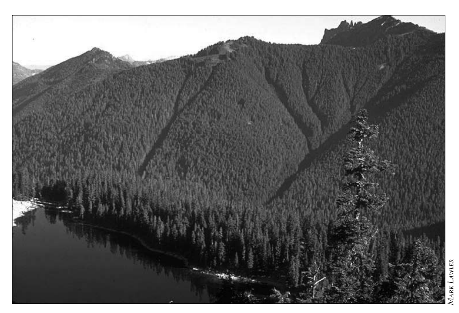
Sunset Lake, in the center of the new Wild Sky Wilderness, with old growth forests in the valley of Trout Creek below.

Thanks to some unusual geography, salmon and steelhead can ascend and spawn in the North Fork Skykomish to within five miles of the Cascade crest. One or both banks of the North Fork