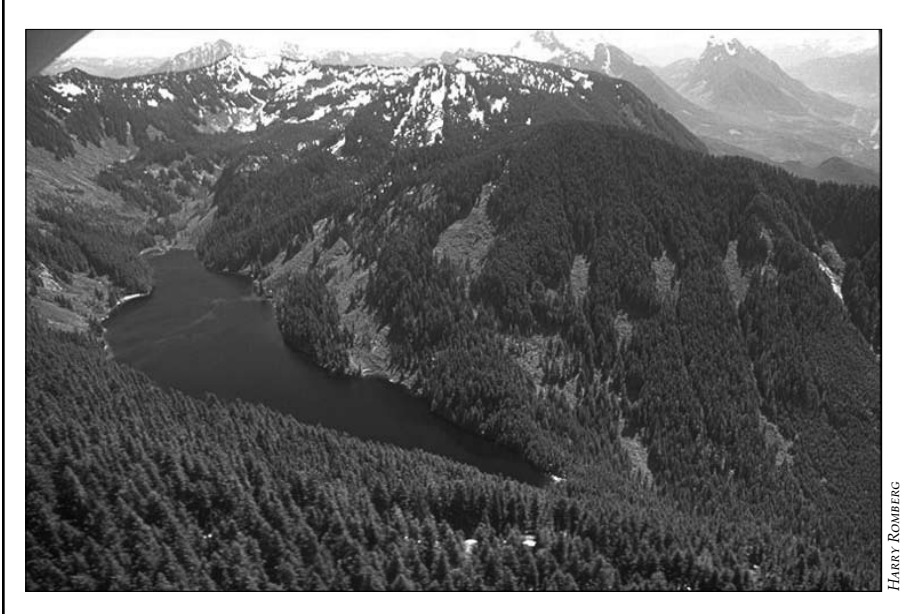
Aerial view of Lake Isabel.